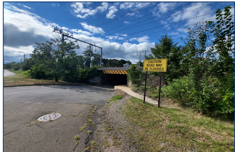
The “Cattle Crossing” from Indian Neck Road

On March 1, 2023 at the Branford Community House, the Town and CIRCA will be conducting a workshop for the public to discuss flooding risks in this neighborhood and potential solutions being considered to control those risks.