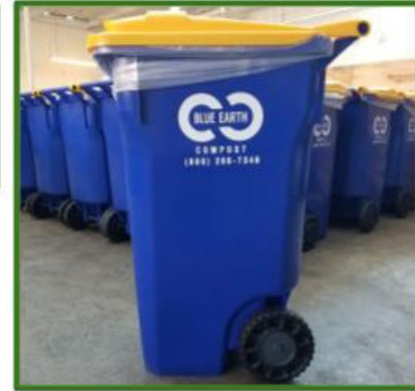
Blue Earth Compost also offers a home collection service. Visit www.blueearthcompost.com

The program is free of charge and will help the Town become more environmentally friendly. Just bring your food scraps in a container or compostable bag to the Transfer Station and deposit them into the specially marked containers. To learn more, contact Diana McCarthy-Bercury - (203) 315-0637 or dbercury@branford-ct.gov